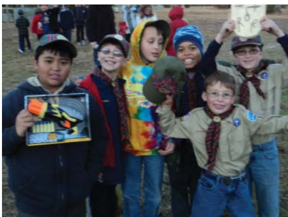
The Den 2 Webelos at the Webelos Olympics

Hear ye, hear ye. Pack 1046 is looking for someone to help make sure that everyone gets the word about all of our activities. If you can help put together a plan to improve our communication methods, using more modern tools, please contact Karl Middour, eandk.middour@verizon.net or 301-809-6883.