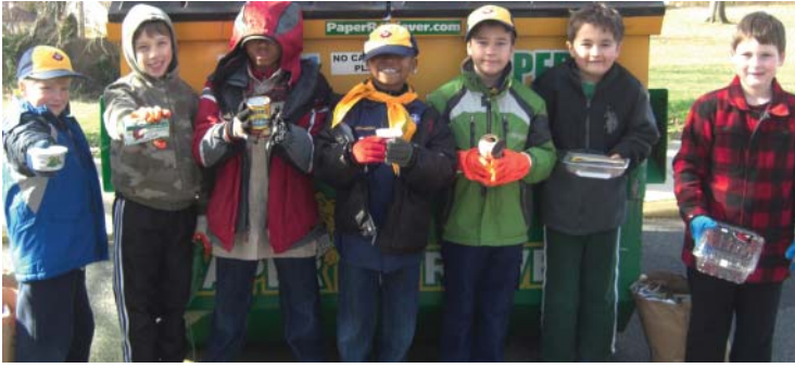
The Wolves of Dens 1 and 7 Joined Together to Clean Up the Environment at Kenilworth Elementary