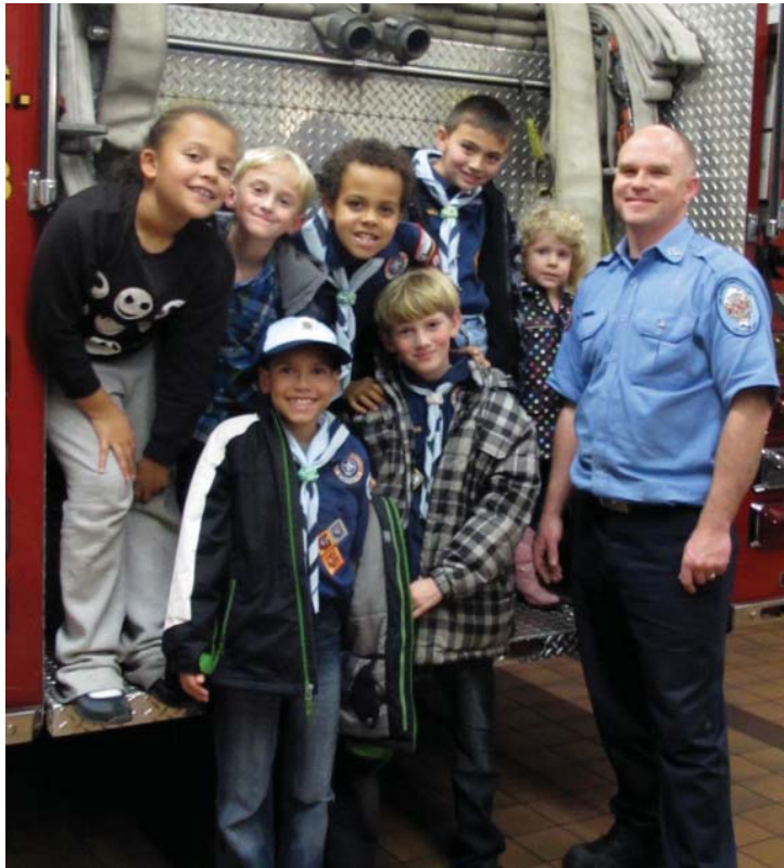
The Den 4 Bears Visit the Crofton Fire Station

Cars must be weighed at one (or both) of these weigh-ins or they will not be qualified to race. Extra weights will not be available at the weigh-ins so please be prepared with what you need.